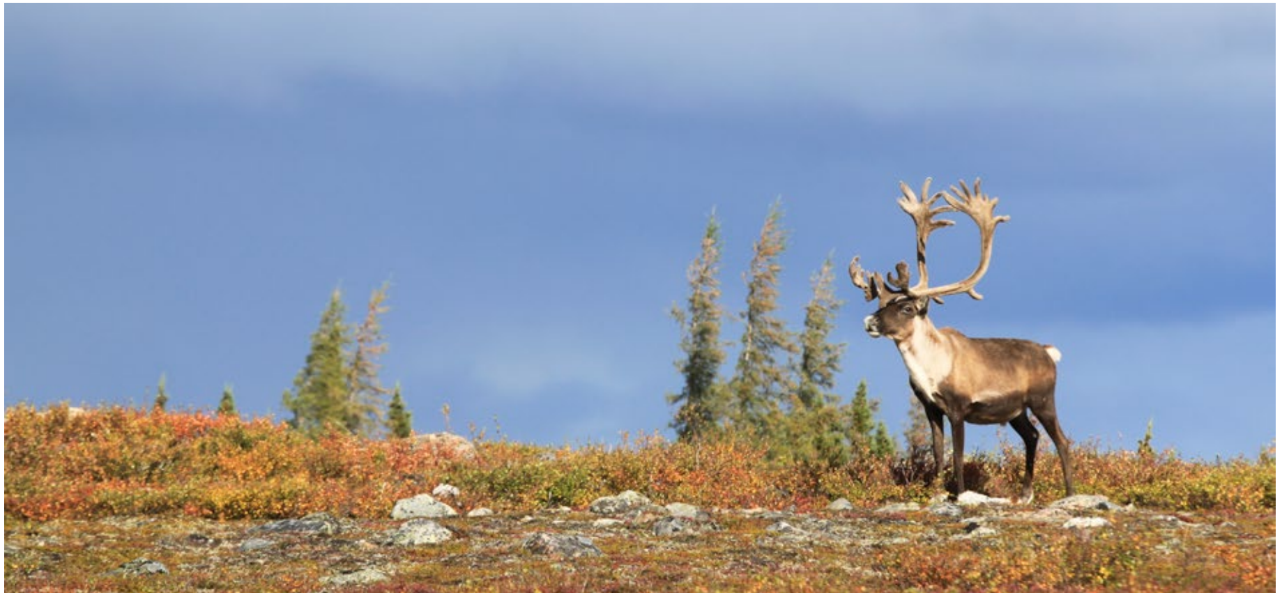
© Joshua Pearlman (photo taken north of Seal River at Baralzon Lake)